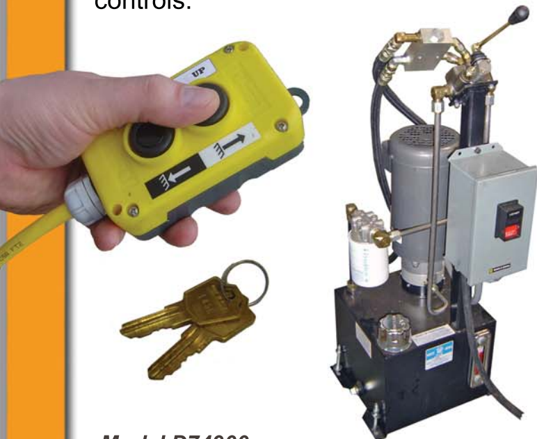
Model D74900 Patent Pending An ISO 9001:2000 Company Specifications subject to change without notice

Check out our website! WWW.PERKINSMFG.COM