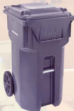
D6207 & 08 only