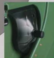
D6208 & 12 only

Perkins Manufacturing Company 737 Oakridge Drive Romeoville, IL 60446 (708) 482-9500 Fax: (708) 354-5878 Email: tuckaway@perkinsmfg.com www.Perkinsmfg.com TOLL FREE 800-882-5292