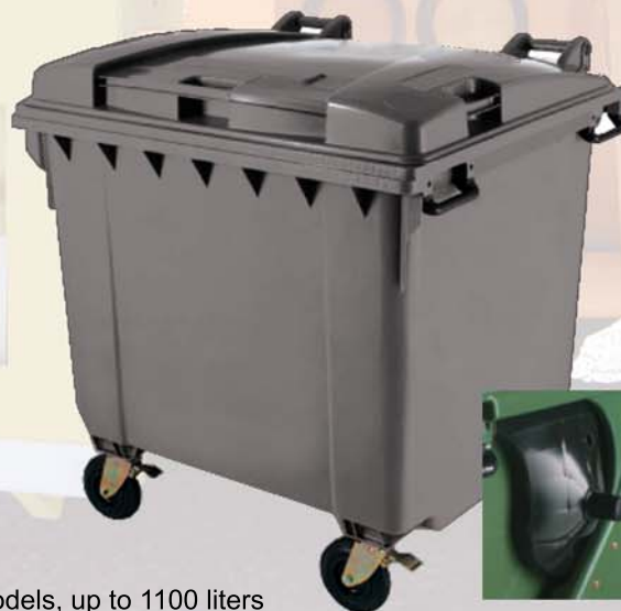
All models, up to 1100 liters