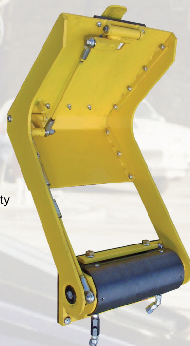
Pictured: D6073x for deeper dumping